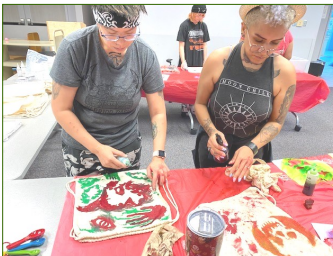
Las Palmas teen and adult fall bag stenciling activities

totes, now available for a donation of $6 each.