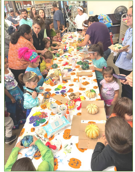
Right: Pumpkin painting (This one seemed to be very popular!)