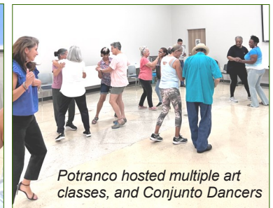
Potranco hosted multiple art classes, and Conjunto Dancers