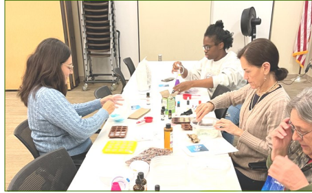
Left: Snake at Encino Fall Fest