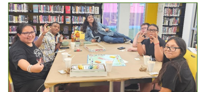
Top: McCreless Friends showed up for the End-of-Summer party.