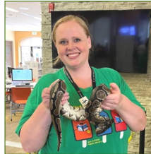
and adults learned about various

animals including a three-banded armadillo, a python, a tenrec, a fennec fox, a wallaby, and more! At the end of the program, attendees got to pet the python, armadillo, and wallaby! Friends also supported lots of fun programs for children including crafts for kids and tweens, and programming like “Let’s Build” that included STEM play with LEGOs, play dough, straws and connectors!