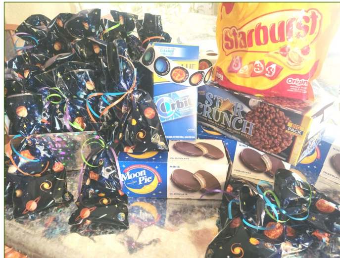
Donation bags for the December 14 McCreless Book Sale and Plant Swap

Learn more: http://saspeakup.com/CarverLibrary