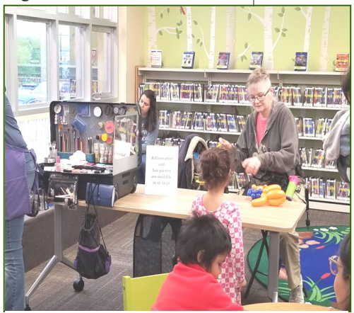
Friends of the Forest Hills Library sponsored the balloon artist and face painter in the children's area during the Library Grand Reopening on Mar. 18, 2023.

After the Forest Hills Library had been closed for more than two years for renovations, the Grand Reopening was held on Mar. 18. The Friends table was one of the stops on the Forest Hills Passport route, where visitors could get a prize if they visited all 6 locations listed in the Passport. The Friends sponsored the balloon artist and face painter that entertained children during the event.