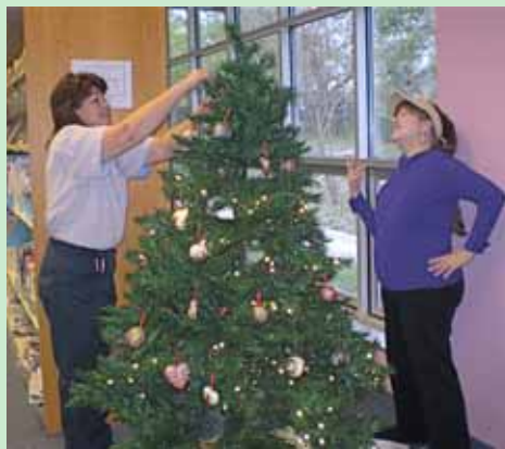
Thousand Oaks Friends decorated the library for the holidays.