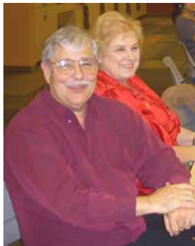
Igo Friends celebrated Christmas with a White Elephant gift exchange.

More photos are on the FOSAPL website: www.friendsofsapl.com .