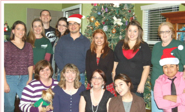
Happy Holidays from Parman Library