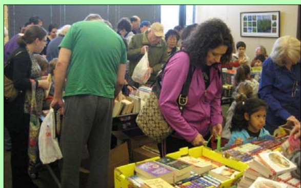
Semmes Book Sale

T his year's Big Read title is Bless Me, Ultima by Rodolfo Anaya . Encourage your family, friends, neighbors and co-workers to join in this city-wide celebration to read and discuss the same book. Big Read activities will take place throughout the Library system during the month of April. For details, please pick up a Big Read calendar of events at any San Antonio Public Library location, visit our website www.mysapl.org , or call (210) 207-2638.