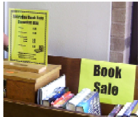
Johnston Branch Friends has an on-going book sale called "BookNook."