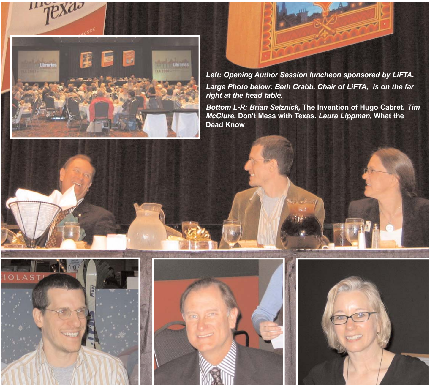
Left: Opening Author Session luncheon sponsored by LiFTA.