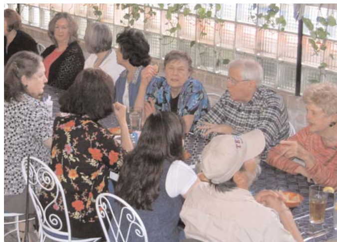
Left: Book Sale Shoppers Both below: Book Cellar Volunteer Appreciation Luncheon at La Fogata, Feb. 26